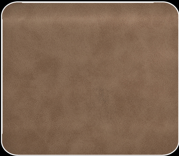
Design : AMAZON FR Colour : 040 Beige

Flex Resistance Flame Resistance Antimicrobial UV Resistance