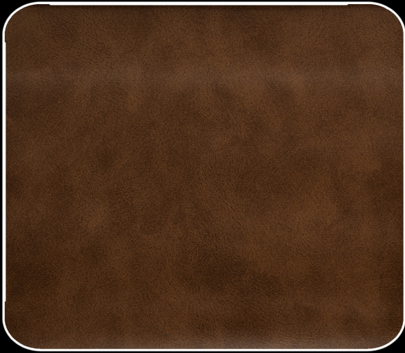
Design : AMAZON FR Colour : 320 Light Brown

Weight : 550gr ±40 Width : 140cm ±40 Abrasion Resistance : >100.000 Oeko - Tex Standart