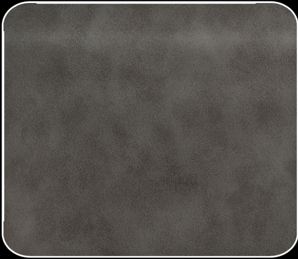
Design : AMAZON FR Colour : 620 Smoked

Weight : 550gr ±40 Width : 140cm ±40 Abrasion Resistance : >100.000 Oeko - Tex Standart