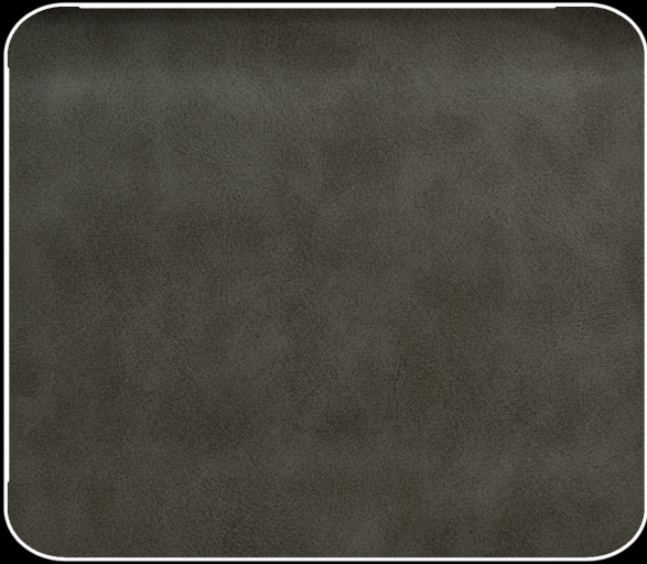
Design : AMAZON FR Colour : 060 Taupe

Weight : 550gr ±40 Width : 140cm ±40 Abrasion Resistance : >100.000 Oeko - Tex Standart