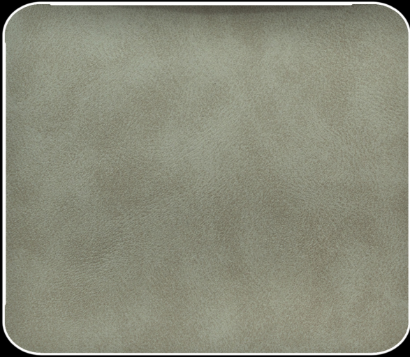
Design : AMAZON FR Colour : 010 Ivory

Weight : 550gr ±40 Width : 140cm ±40 Abrasion Resistance : >100.000 Oeko - Tex Standart