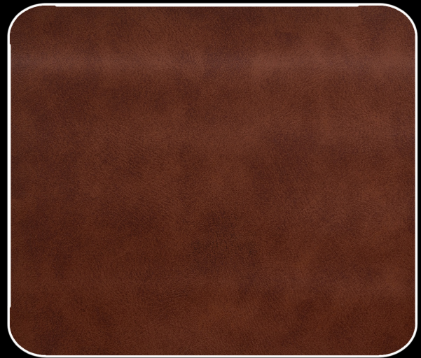
Design : AMAZON FR Colour : 260 Cinnamon

Flex Resistance Flame Resistance Antimicrobial UV Resistance