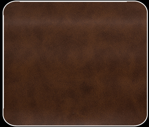
Design : AMAZON FR Colour : 326 Brown

Flex Resistance Flame Resistance Antimicrobial UV Resistance