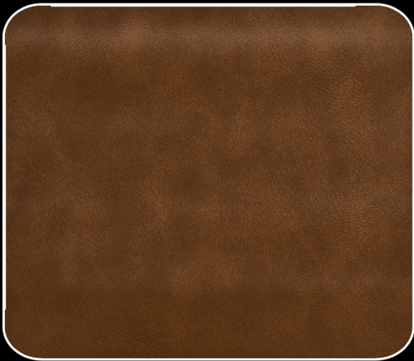
Design : AMAZON FR Colour : 300 Copper

Flex Resistance Flame Resistance Antimicrobial UV Resistance