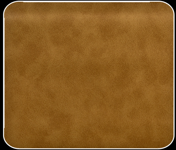
Design : AMAZON FR Colour : 120 Mustard

Flex Resistance Flame Resistance Antimicrobial UV Resistance