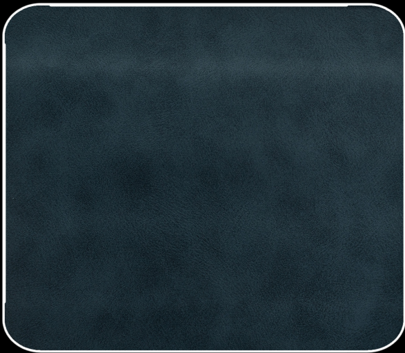
Design : AMAZON FR Colour : 540 Navy

Flex Resistance Flame Resistance Antimicrobial UV Resistance