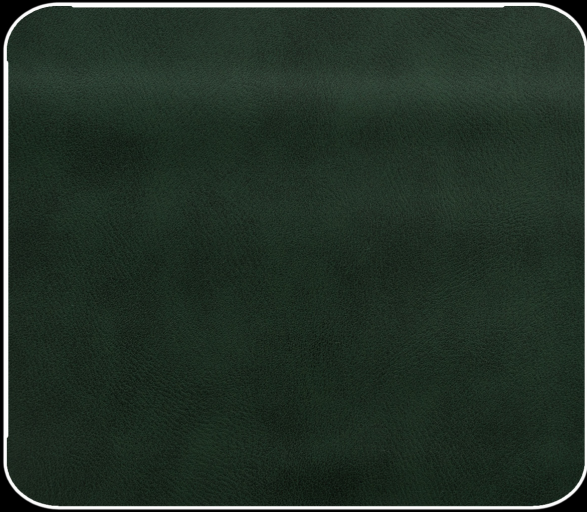
Design : AMAZON FR Colour : 430 Green

Weight : 550gr ±40 Width : 140cm ±40 Abrasion Resistance : >100.000 Oeko - Tex Standart