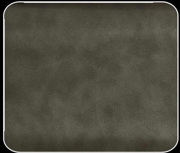
Design : AMAZON FR Colour : 400 Pale Green

Flex Resistance Flame Resistance Antimicrobial UV Resistance