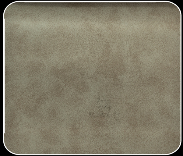
Design : AMAZON FR Colour : 020 Stone

Flex Resistance Flame Resistance Antimicrobial UV Resistance