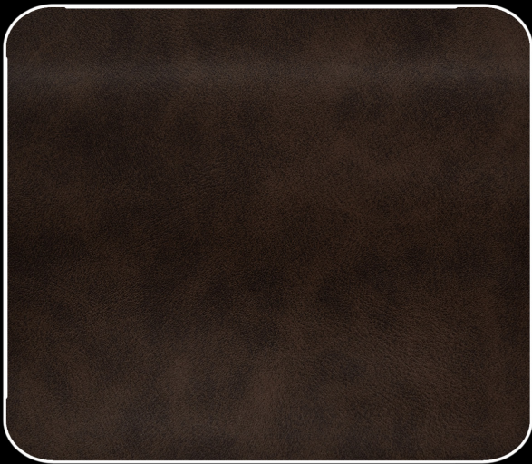
Design : AMAZON FR Colour : 337 Dark Brown

Flex Resistance Flame Resistance Antimicrobial UV Resistance