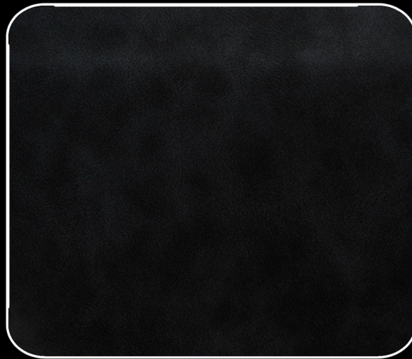
Design : AMAZON FR Colour : 901 Black

Flex Resistance Flame Resistance Antimicrobial UV Resistance