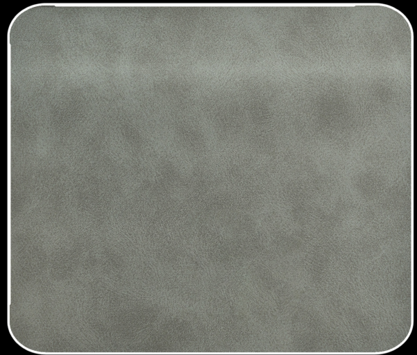
Design : AMAZON FR Colour : 605 Grey

Flex Resistance Flame Resistance Antimicrobial UV Resistance