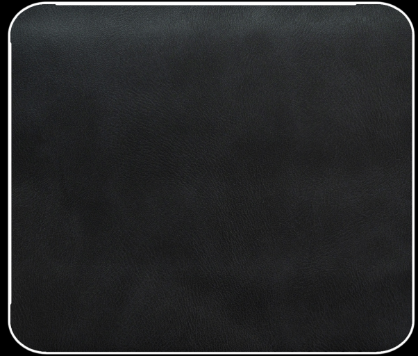
Design : AMAZON FR Colour : 650 Anthracide

Flex Resistance Flame Resistance Antimicrobial UV Resistance